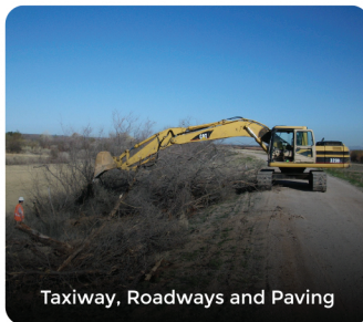
Taxiway, Roadways and Paving