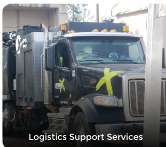
Logistics Support Services