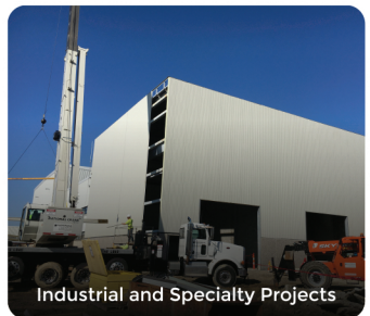
Industrial and Specialty Projects