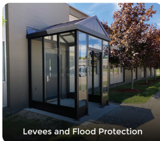
Levees and Flood Protection