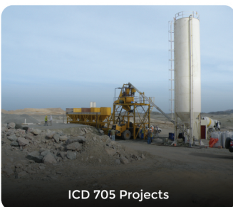
ICD 705 Projects