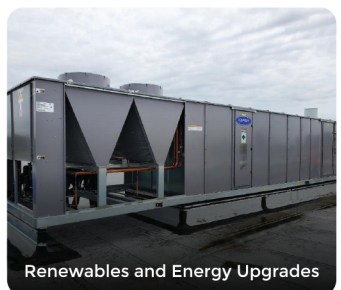
Renewables and Energy Upgrades