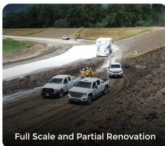
Full Scale and Partial Renovation