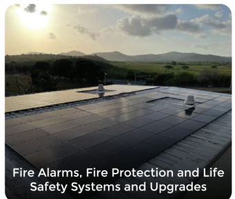
Fire Alarms, Fire Protection and Life Safety Systems and Upgrades